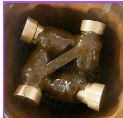
Magnetite collected on the external surface of the Rare Earth Magnetic Grate

At the core of the FILTER POT MEGA lies a total of three 316SS Magnetic Grates each containing six extremely powerful Rare Earth Magnetic Rods for a total of 18. These Magnetic Grates have been designed to optimise the fluid dynamics required to capture magnetic corrosion particles as they enter the vessel body before the system water flows down to the Cartridge Filter below.