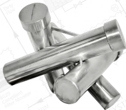
Rare Earth Magnetic Rods housed within a 316SS Magnetic Grate